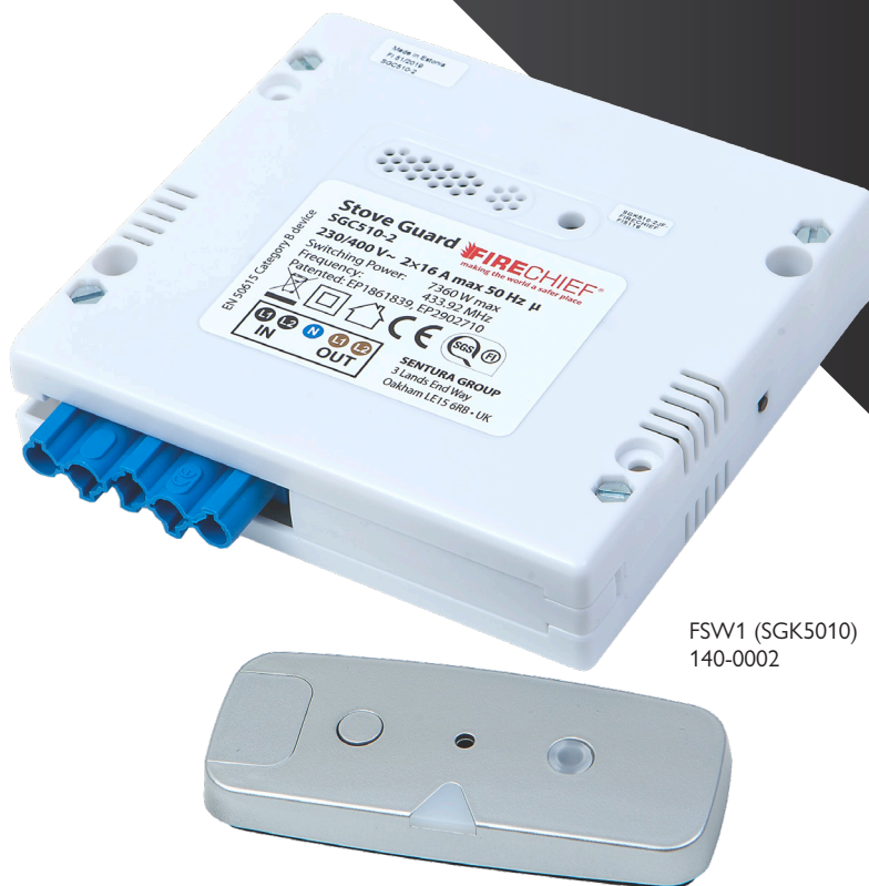
FSW1 (SGK5010) 140-0002